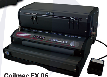
Coilmac EX 06 (ROUND)