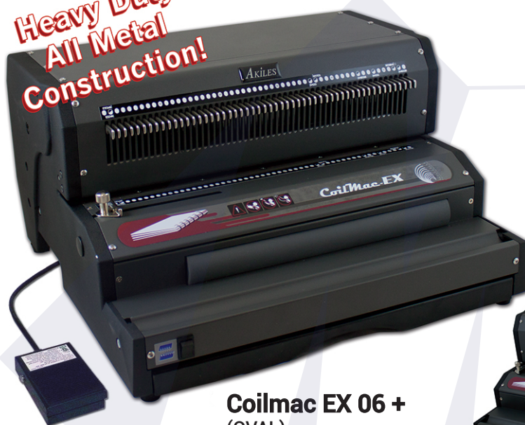
Coilmac EX 06 + (OVAL)