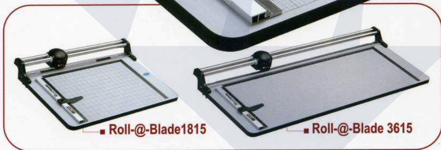
■ Roll-@-Blade 1815

Extra Wide Work Table With English/Metric Ruler & Special Grid Ruler Guide: For an easy alignment while satisfying all of your converting needs!